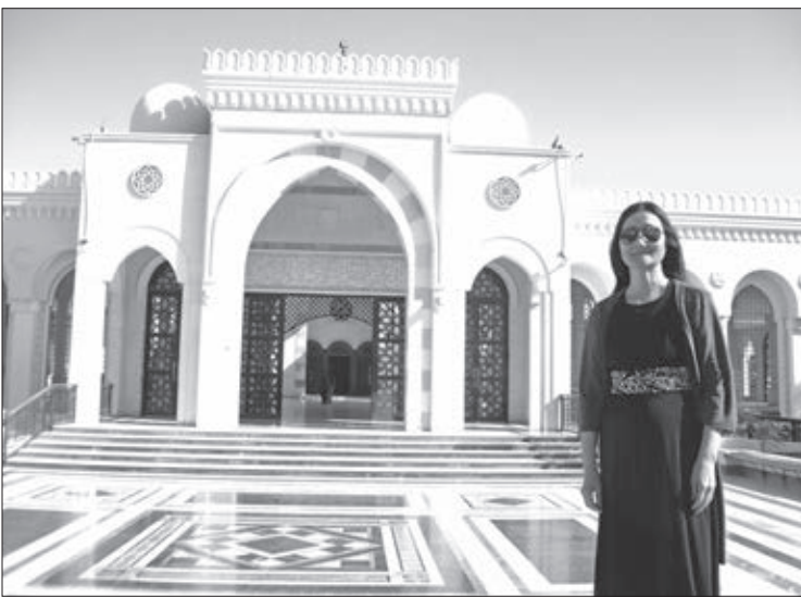
▲ this pristine mosque in Jordan is an architectural masterpiece