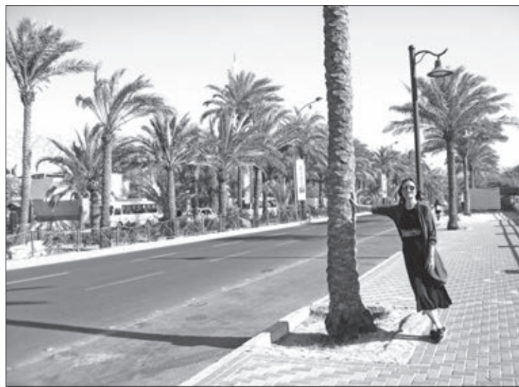
▲ seeing palm trees in desert Jordan was a pleasant surprise