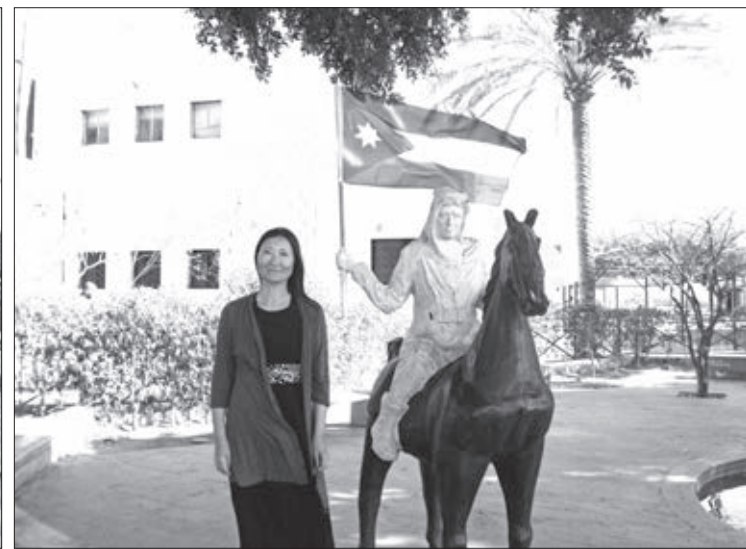
▲ in Jordan, history is the heart and soul of the land