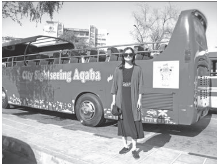
▲riding the bright red City Sightseeing Bus to visit Aqaba in Jordan