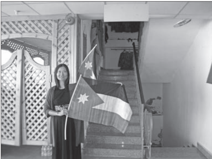
▲proudly holding Jordan's national flag