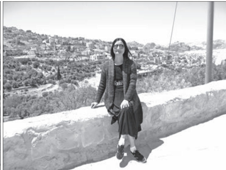
▲enjoying a panoramic view of the beautiful city of Aqaba in Jordan